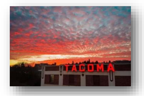
Gamble At Emerald Queen Casino