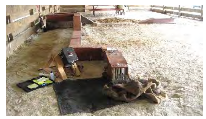
T-N-T Tunnel at 2018 Summer Celebration Trials

No entry fee. Fastest times from class 185.